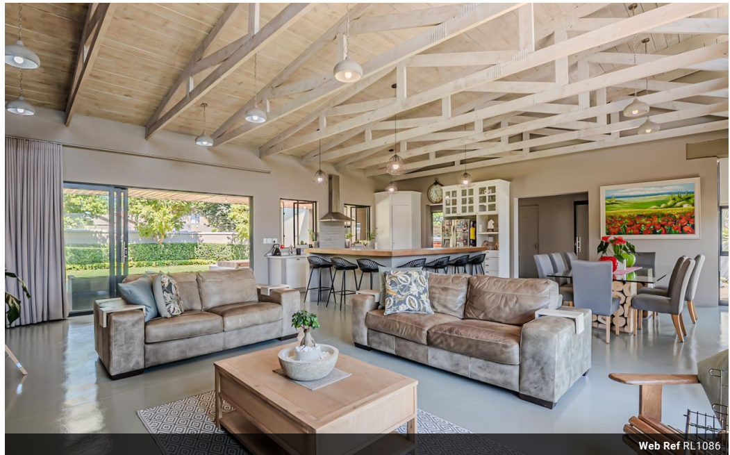
Web Ref RL1086